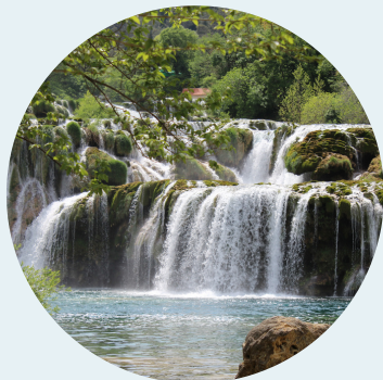
NP KRKA 85,00 EUR