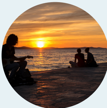
ZADAR I NIN 75,00 EUR