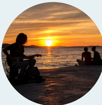
ZADAR I NIN 65,00 €