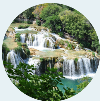
NP KRKA 75,00 €