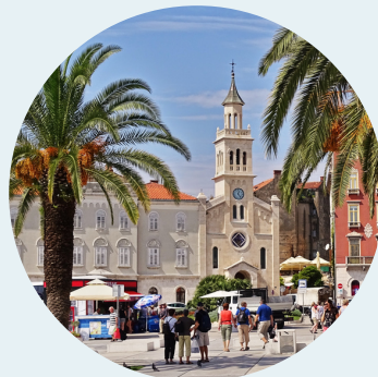
SPLIT I TROGIR 85,00 EUR