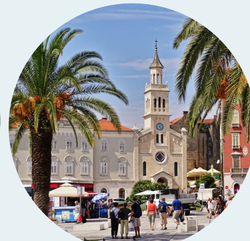
SPLIT I TROGIR 75,00 €