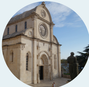
ŠIBENIK I FALCONING CENTER 65,00 €