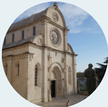
ŠIBENIK I SOKOLARSKI CENTAR 75,00 EUR